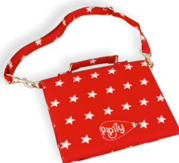
PIPITY ACTIVITY CASE